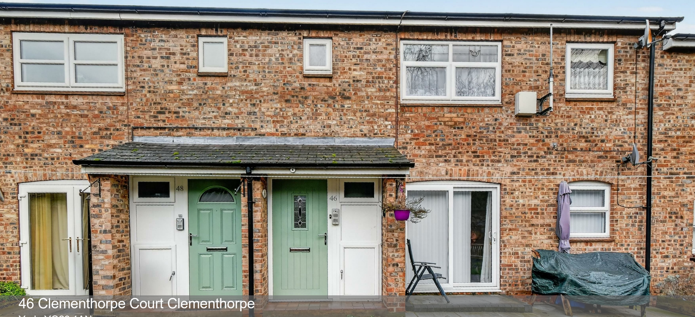
46 Clementhorpe Court Clementhorpe York, YO23 1AN £165,000